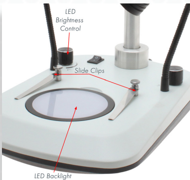
Adjustable LED Back Light