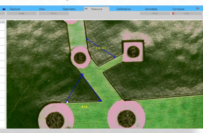
ezImageX3 Download Included