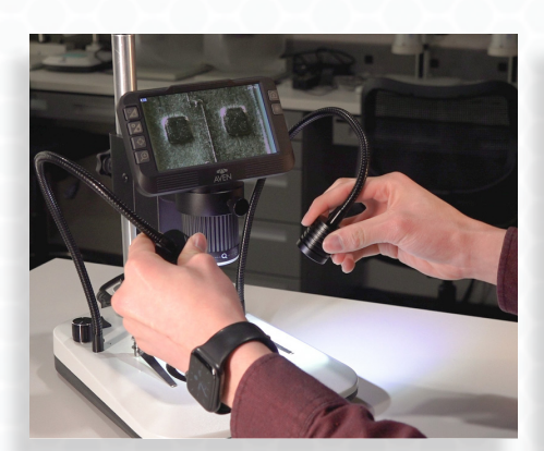
Two 14.5" Flexible Goosenecks w/ Adjustable LEDs